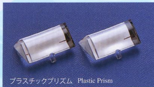
プラスチックプリズム Plastic Prism